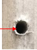
Guide Hole Interior View

Centered in the 7/8" hole, Drill a pilot hole 3/16" from the outside to the inside.